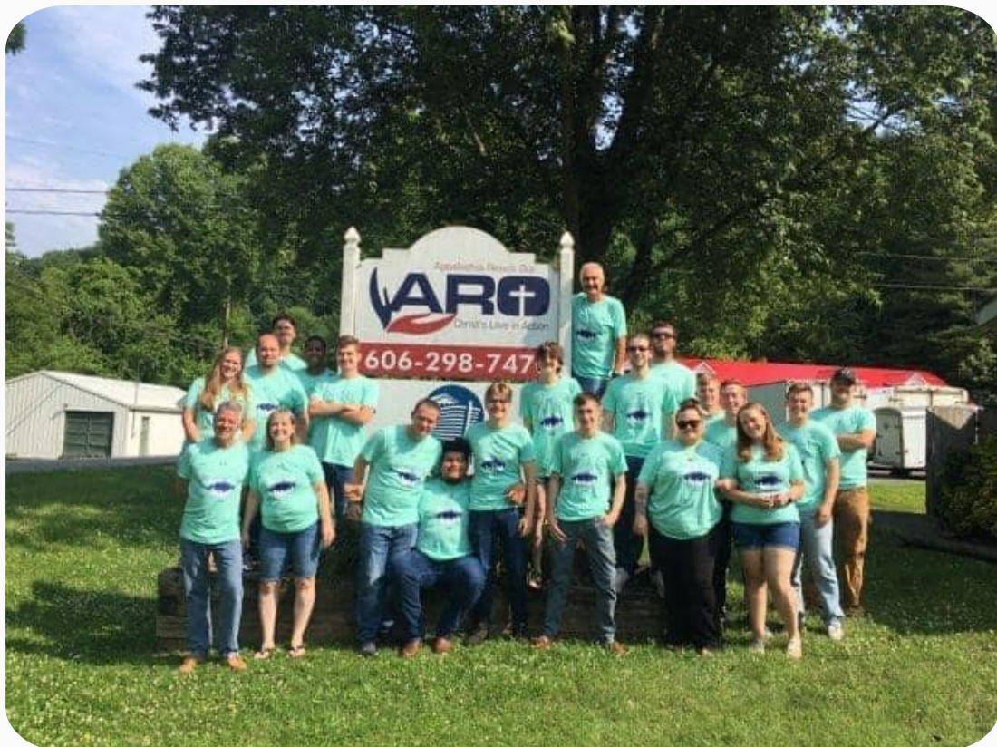
Richardson Church of the Nazarene