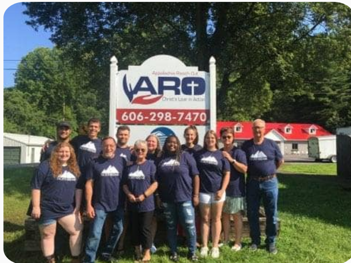
Northridge Community Church