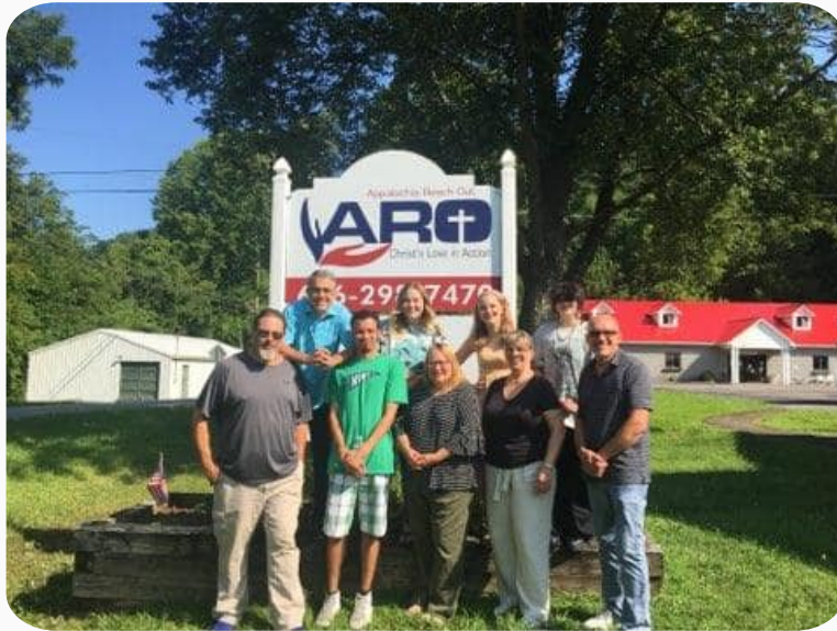
Medina Church of the Nazarene