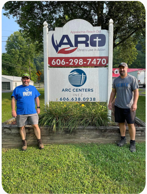
Spiceland Church of the Nazarene