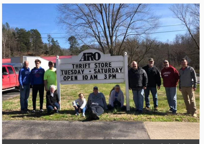
A special thanks to Harvest Community Church in Michigan who loaded a trailer for the ARO Thrift Store, and to those from Turkey Creek Nazarene and the community who helped unload the trailer...