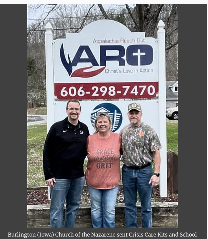
Burlington (Iowa) Church of the Nazarene sent Crisis Care Kits and School Pal Packs to Martin County. Thank you for your donations that will be a great blessing to those in our community!