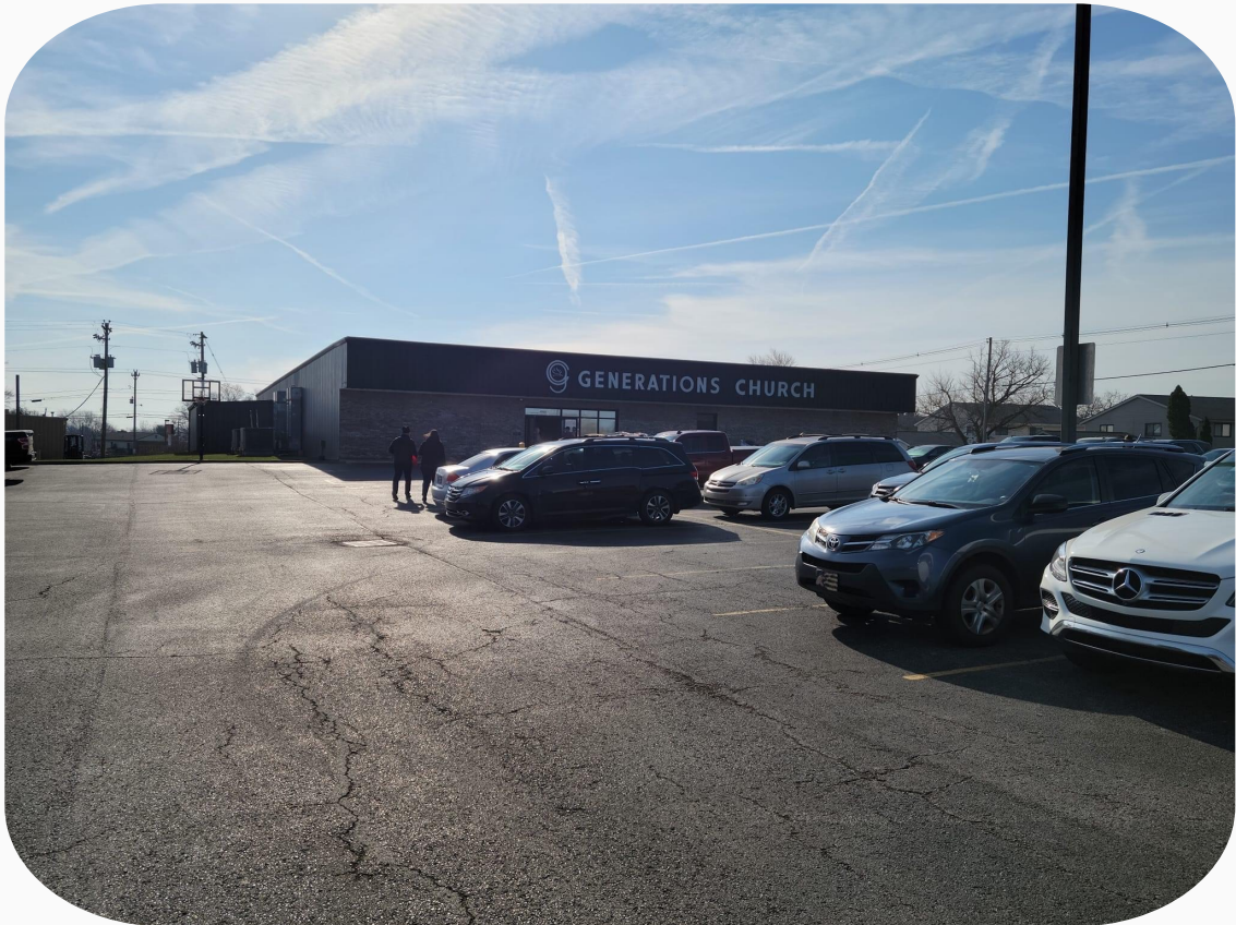
ARO on the Road 2023-Generations Church, KY

It's a blessing to continue to partner with this faith community! They have been a faithful partner in the last few years!!