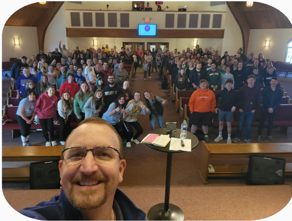
ARO on the Road 2023- Southwest Indiana District NYI Celebrate Life, IN & Parkview Church of the Nazarene, IN